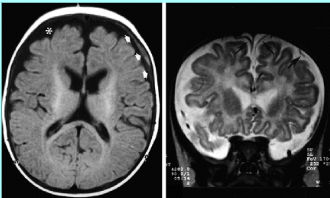
Fig. 2. Magnetic resonance imaging studies. Upper: A transaxial, T 1 -weighted image of the head demonstrating a small left frontal subdural hematoma of mixed intensities (white arrow heads). There is a prominent, symmetrical, extracerebral fluid collection of the same intensity as ventricular cerebrospinal fluid (CSF) (white asterisk). Lower: Coronal, T 2 -weighted image demonstrating that the extracerebral fluid remains at the same intensity

A computerized tomography scan of the head revealed a small acute subdural hematoma that was associated with bilateral low-density extracerebral fluid collections. On Day 3 postadmission magnetic resonance imaging established that these fluid collections reflected diffuse enlargement of the subarachnoid spaces (Fig. 2). A skeletal survey was negative.